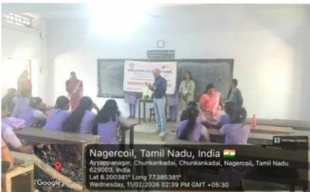
Nagercoil, Tamil Nadu, India Ayyappanagar, Chunkankadai, Chunkankadai, Nagercoil, Tamil Nadu 629003, India Lat 8.200381° Long 77.385381° Wednesday, 11/02/2026 02:39 PM GMT +05:30