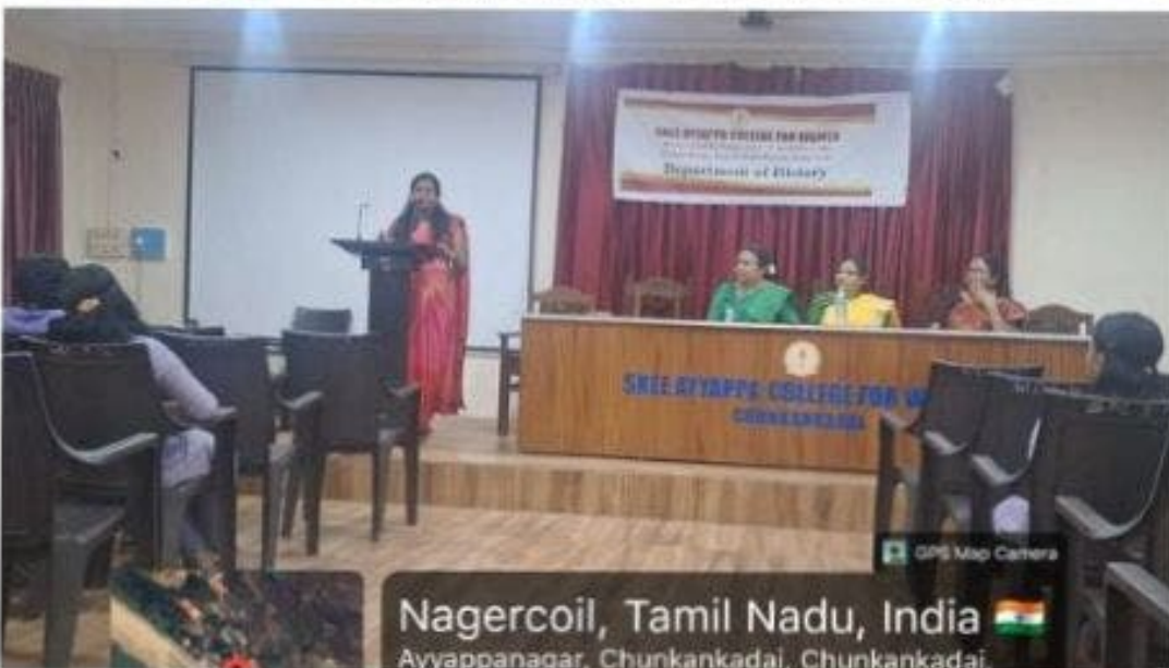
Nagercoil, Tamil Nadu, India Ayyappanagar, Chunkankadai, Chunkankadai,