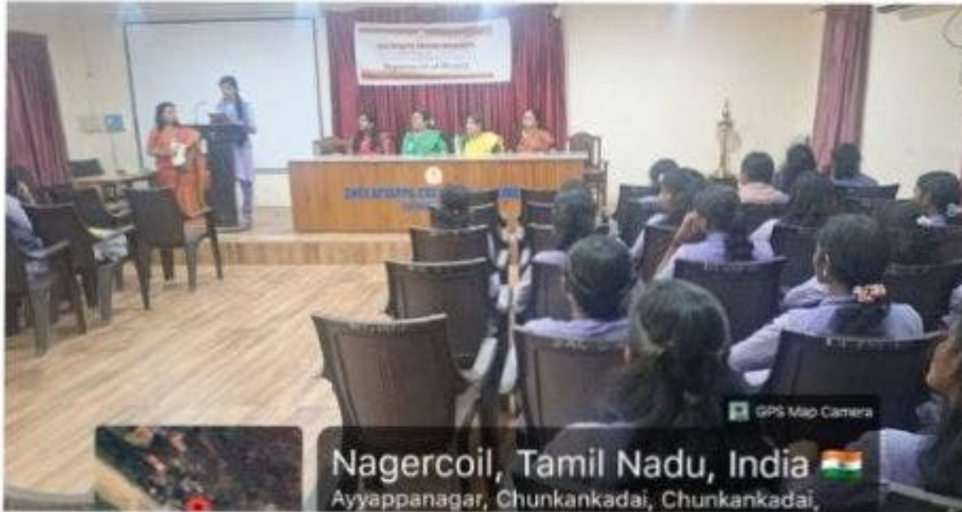
Nagercoil, Tamil Nadu, India Ayyappanagar, Chunkankadai, Chunkankadai,