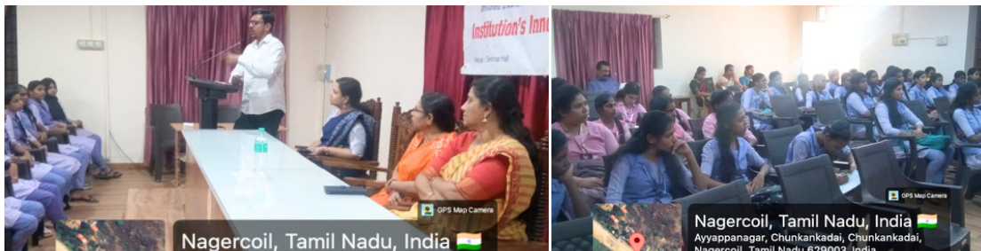
Nagercoil, Tamil Nadu, India