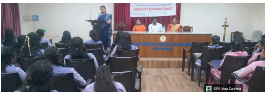
Nagercoil, Tamil Nadu, India

“The future belongs to those who believe in the beauty of their dreams.” — ELEANOR ROOSEVELT