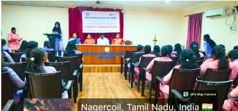
Nagercoil, Tamil Nadu, India