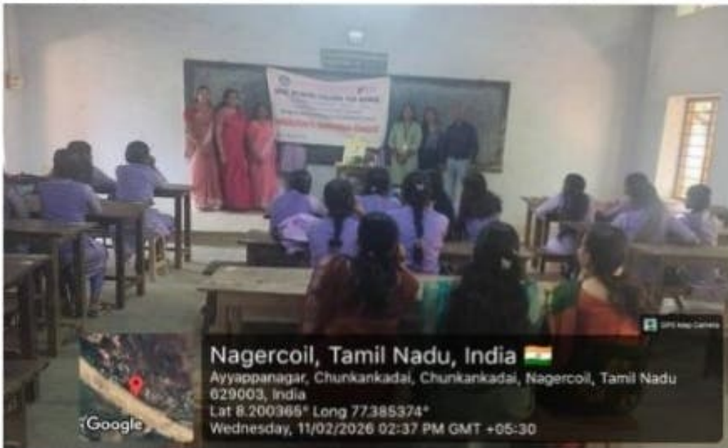
Nagercoil, Tamil Nadu, India Ayyappanagar, Chunkankadai, Chunkankadai, Nagercoil, Tamil Nadu 629003, India Lat 8.200366° Long 77.385374° Wednesday, 11/02/2026 02:37 PM GMT +05:30