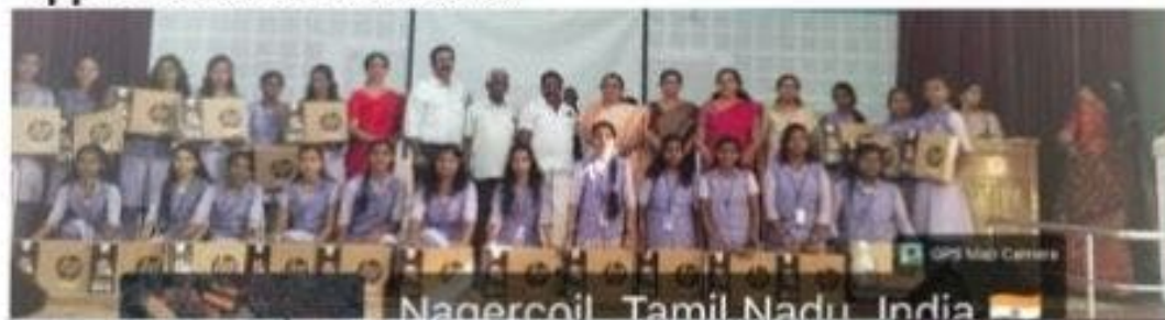
Nagercoil, Tamil Nadu, India

“Digital dreams take flight – Tamil Nadu supports students with free laptops , enabling digital learning, bridging the technology gap, and fostering equal opportunities in education.