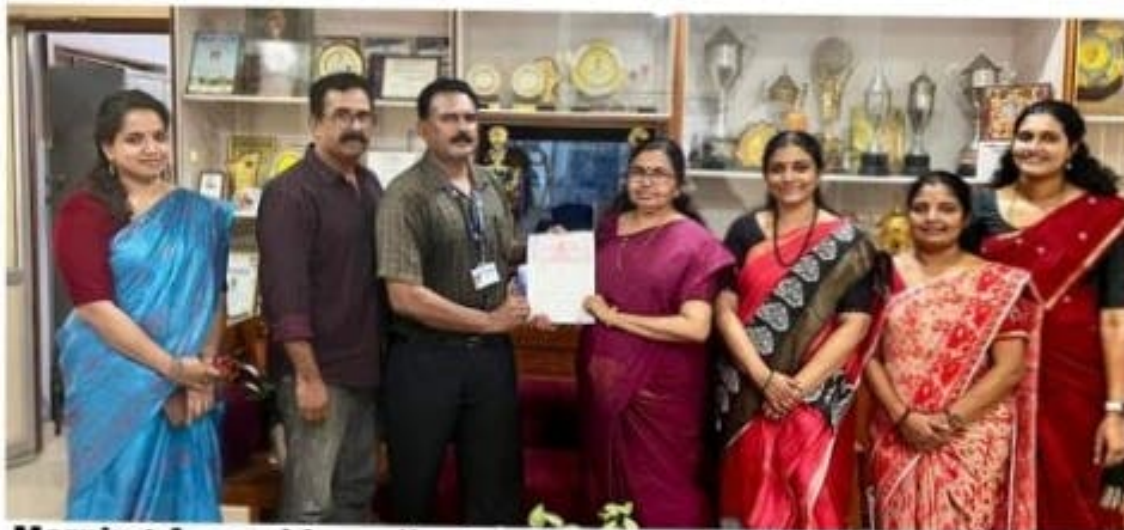
Morning Assembly as the best practice conducted by department of commerce (Regular)

A Memorandum of Understanding (MoU) was formally signed between the Nuclear Information Centre (NIC), Kudankulam Nuclear Power Project (KKNPP), Tirunelveli and Sree Ayyappa College for Women on February 27, 2026 with the objective of fostering collaboration in research, skill development, and knowledge exchange. Through this partnership, both institutions committed to organising workshops, seminars, and training programs that will provide students and faculty with exposure to advanced developments in nuclear science and technology. The MoU aims to build academic-Industry linkages, enhance employability, and empower young women to contribute meaningfully to national progress.