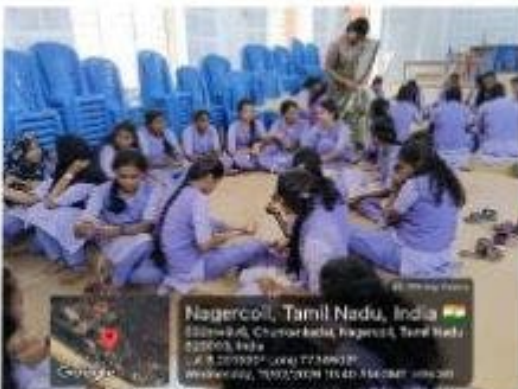
Nagercoil, Tamil Nadu, India Sree Ayyappa College for Women, Nagercoil, Tamil Nadu 625003, India T: +91 94477 77369 www.sacwomens.edu.in

“Sustainable Entrepreneurship: Skill Development in Banana Fiber Products for NSS Volunteers” — A one-day workshop organized by the Institution’s Innovation Council (IIC) and NSS Units 96,97 &162 of Sree Ayyappa College for Women with the objective of empowering student volunteers to explore eco-friendly innovations, acquire hands-on skills in banana fiber product development, and foster sustainable entrepreneurial mindsets that contribute to self-reliance and community well-being.