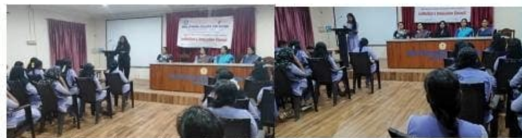
IQAC & TIC organises a session on "Crafting Dreams: An Entrepreneur's Story"