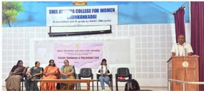
Career Guidance & Placement Cell Organises a Workshop on "Career Craft: Mastering Communication & Aptitude Skills"