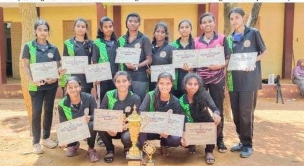
Our Kho-kho team won first place in Block Level Sports Meet -2025, conducted by Ministry of Youth Affairs & Sports, Govt. of Indian, Merav Yuva Bharat Kanniyakumari