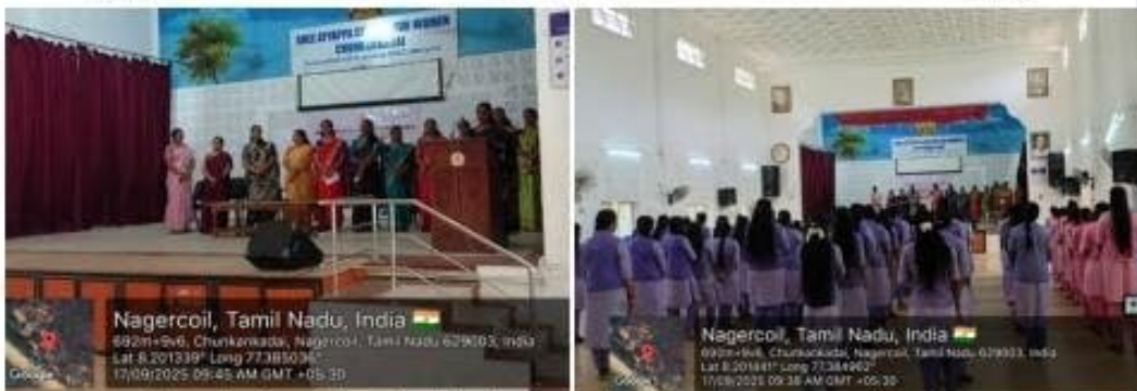
Morning Assembly as Best Practices organised by the Department of Zoology