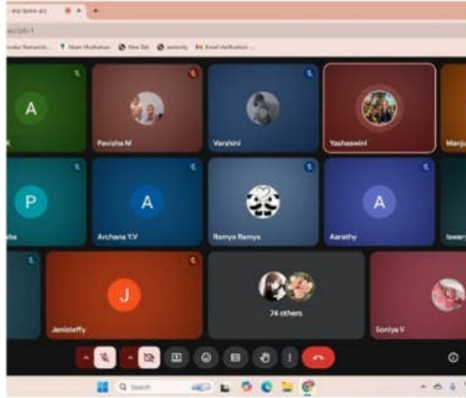
IQAC, MCE Department of Commerce jointly Organises a Online Workshop on "Raising Capital and Managing Finance for startup"