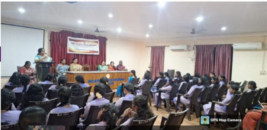
Department of History & AIDWA jointly Organises a Seminar on "பெண்களை பாதுகாக்கும் சட்டங்களும், நடைமுறையும்"