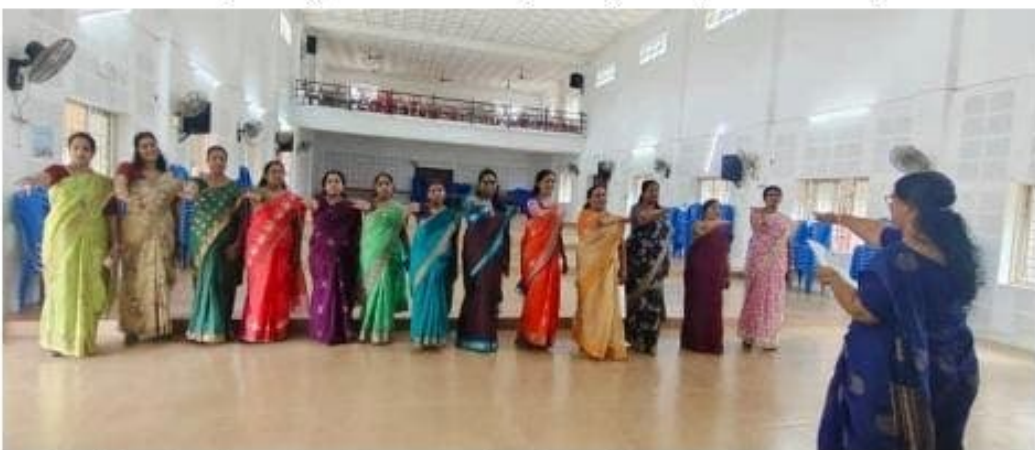
The staff members observed Social Justice Day by taking a pledge at 11.00 am, 17 September 2025, to follow the principles of self-respect, rationalism, brotherhood, equality, humanitarianism and social justice