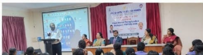
NSS Units Organise a Session on "Viksit Bharat Young Leaders Dialogue (UBYLD) 2026"