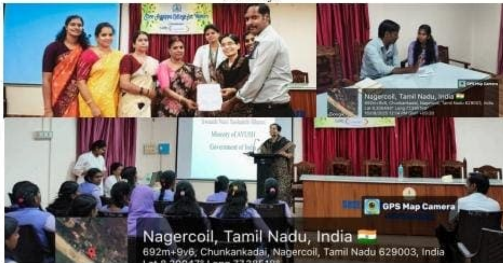
Department of Botany in collaboration with Government Ayurveda Medical College & Hospital conducted one-day workshop and medical camp