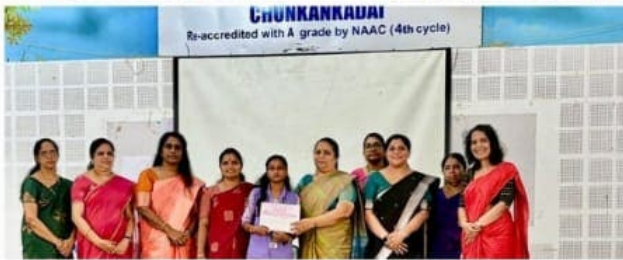
Morning Assembly as Best Practices organised by the Department of Commerce