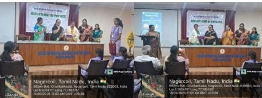
Nagercoil, Tamil Nadu, India 692m+9v6, Chunkankadai, Nagercoil, Tamil Nadu 629003, India Lat: 8.200477° Long: 77.385171° 18/09/2025 11:02 AM GMT +05:30