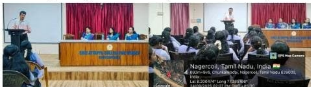
Legal Aid Cell organises an awareness programme on "Rights of Women in the Indian Constitution"