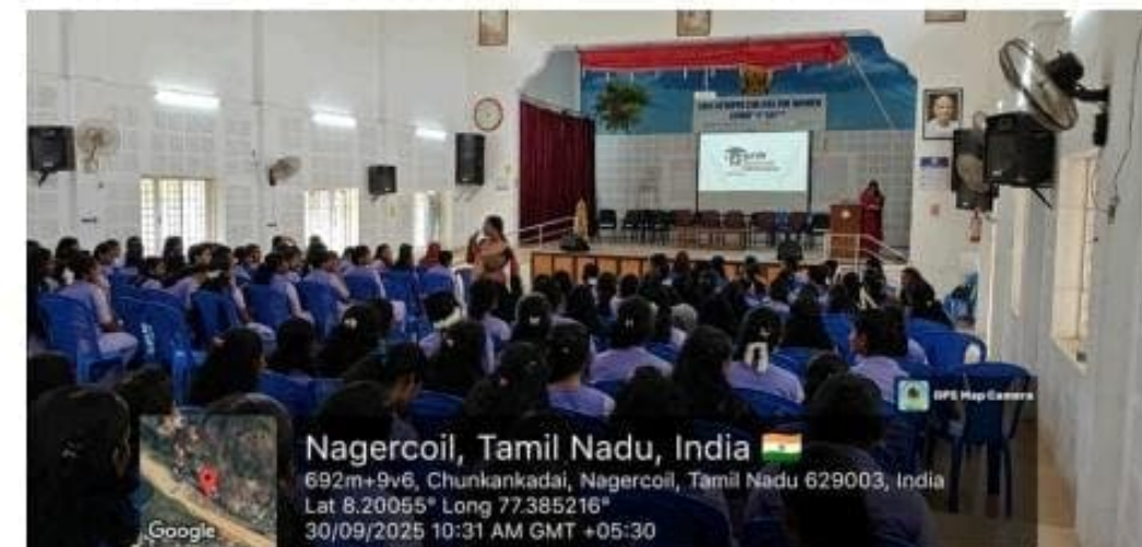
Nagercoil, Tamil Nadu, India 692m+9v6, Chunkankadai, Nagercoil, Tamil Nadu 629003, India Lat 8.20055° Long 77.385216° 30/09/2025 10:31 AM GMT +05:30