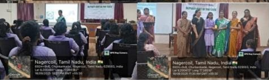
Nagercoil, Tamil Nadu, India 692m+9v6, Chunkankadai, Nagercoil, Tamil Nadu 629003, India Lat: 8.200489° Long: 77.385181° 18/09/2025 10:21 PM GMT +05:30