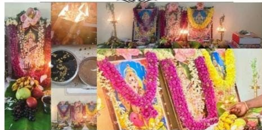
*Spiritual growth and academic excellence go hand-in-hand!* Embracing the festive spirit of Pooja