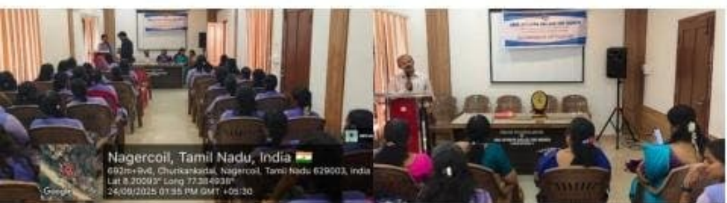
Association Inauguration of Zoology Department