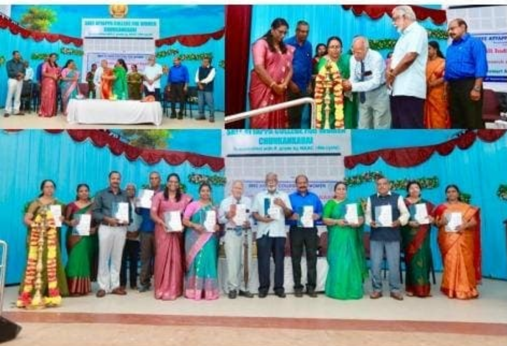
R&DC in collaboration with KAAS organised 17 th All India Conference of KAAS