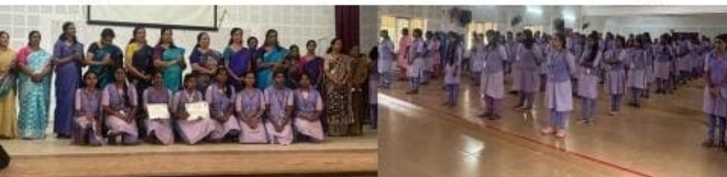
Morning Assembly as Best Practices organised by the Department of Physics