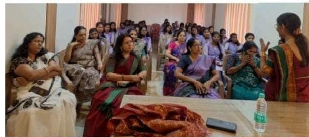
Morning Assembly as Best Practices organised by the Department of History

Alur, Tamil Nadu, India NH 66, Chunkankadai, Alur, Tamil Nadu 629607, India Lat 8.201376, Long 77.385045 09/19/2025 09:37 AM GMT+05:30 Note: Captured by GPS Map Camera