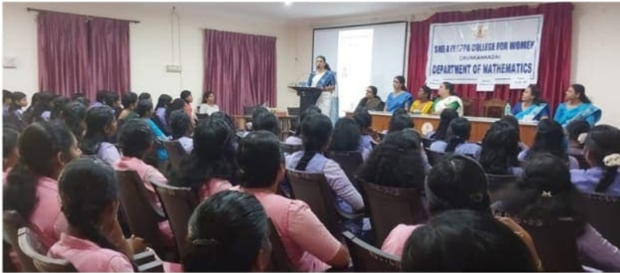
Mathematics Association Inauguration