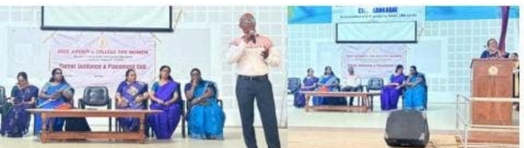
Career Guidance & Placement Cell Organises a session on "Emerging Technologies & Career Opportunities"