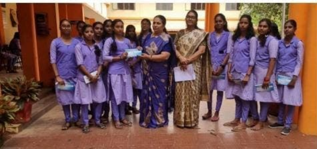
Debit card distributed to Puthumai Penn beneficiaries by the Principal