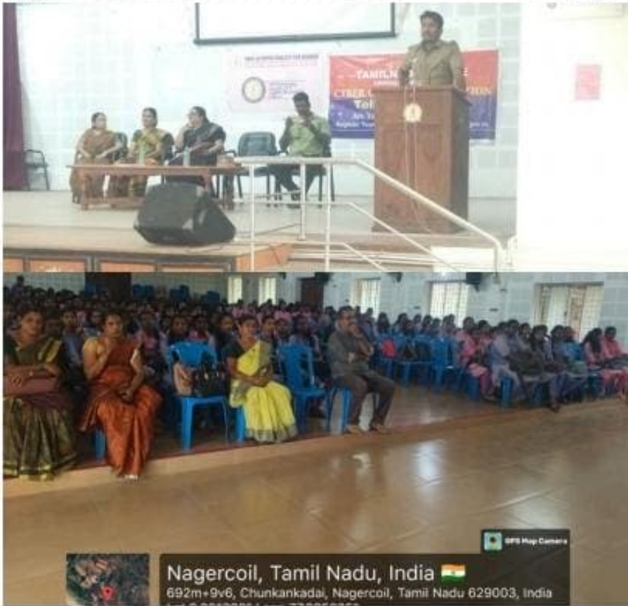
Nagercoil, Tamil Nadu, India 692m+9v6, Chunkankadai, Nagercoil, Tamil Nadu 629003, India

“No one can make you feel inferior without your consent.” —Eleanor Roosevelt