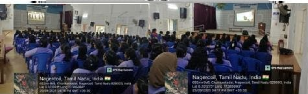
The principal and coordinators made arrangements to view the 'Programme' 'Kalviyal Sirantha 'Tamil Nadu' in our colleges successfully on 25th from 4 pm to 8 pm.