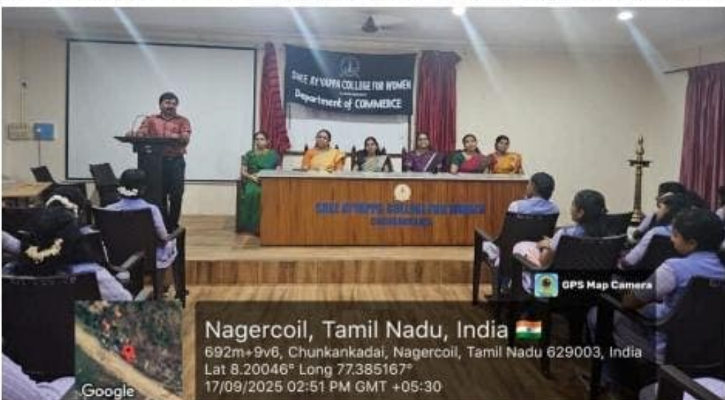
Inauguration of the value-added course in Indian Knowledge System in Commerce, conducted by the Department of Commerce