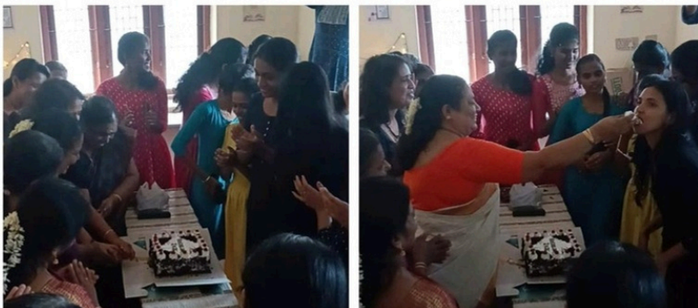
Hostel Day Celebration on April 16, 2025