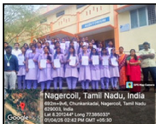
Campus Placement Drive by Foxconn Company Chennai - 37 students selected