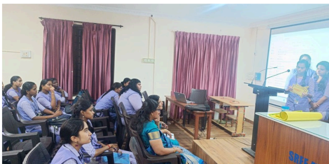
Idea Presentation Competition by IIC - 11 April