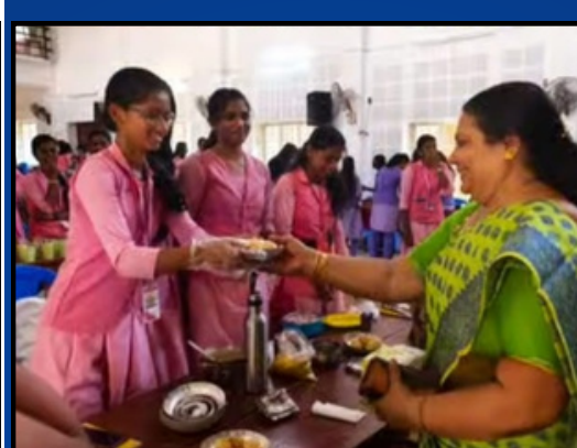
'Earn while you learn' by Dept. of English - March 29, 2025