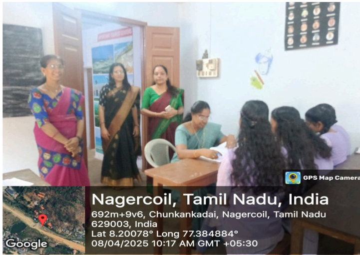
Project viva of III BA History - April 8, 2025