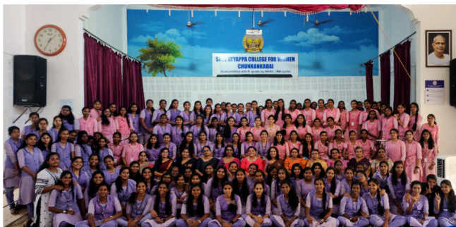
Farewell celebration at English dept