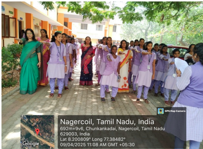
The students and faculty of History Dept taking Pledge in connection with Ambedkar Jayanthi - April 9, 2025