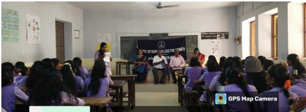
Consumer Rights & Protection organised by Consumer Club & Dept. of Commerce on 11 April