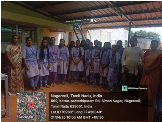
Students Visit to Kalachuvadu Publishers on 21 April 2025