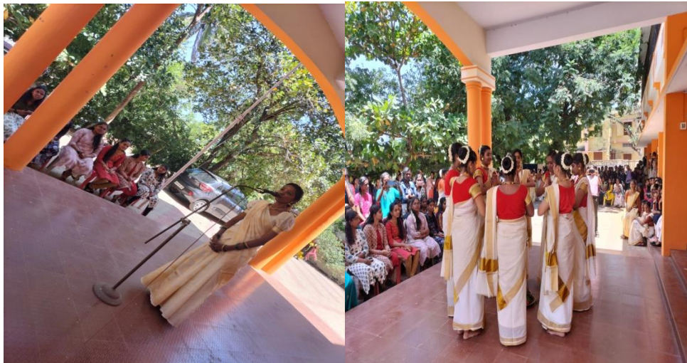
2.Name of the activity: Youth Festival 2023-24