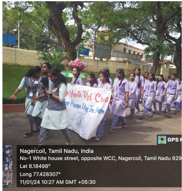
Nagercoil, Tamil Nadu, India No-1 White house street, opposite WCC, Nagercoil, Tamil Nadu 629000 Lat 8.18498° Long 77.428307° 11/01/24 10:27 AM GMT +05:30