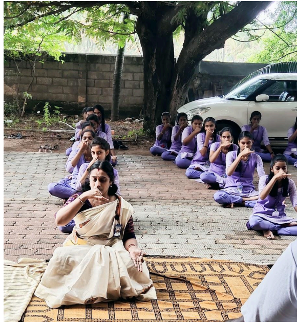
Demonstration of Yoga by the Student Volunteers and the Faculty.