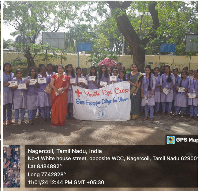
Nagercoil, Tamil Nadu, India No-1 White house street, opposite WCC, Nagercoil, Tamil Nadu 629000 Lat 8.184892° Long 77.42828° 11/01/24 12:44 PM GMT +05:30