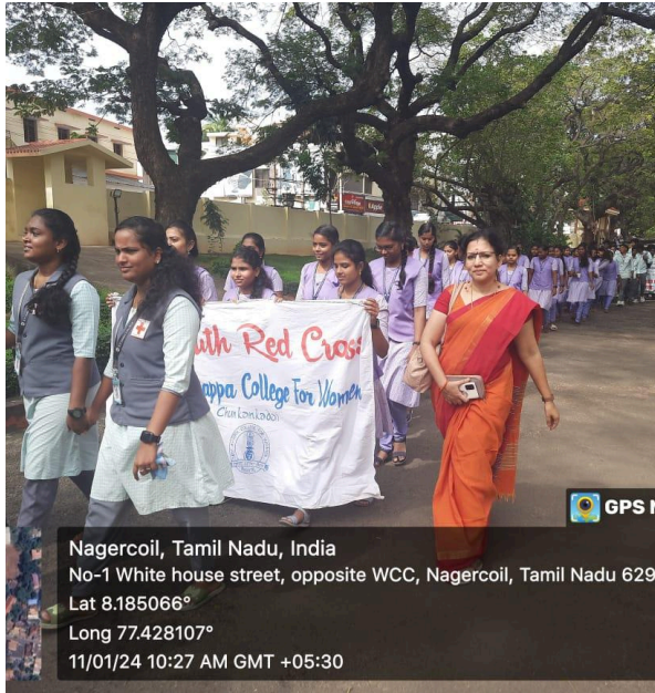
Nagercoil, Tamil Nadu, India No-1 White house street, opposite WCC, Nagercoil, Tamil Nadu 629000 Lat 8.185066° Long 77.428107° 11/01/24 10:27 AM GMT +05:30