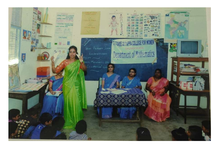
Basic Math Awareness to Students