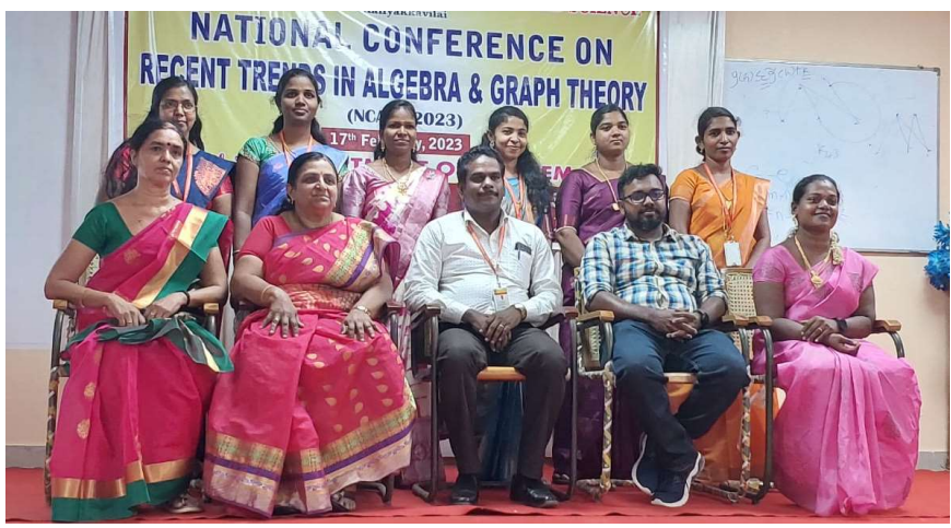
Chaired a session in Nanjil College of Arts and Science