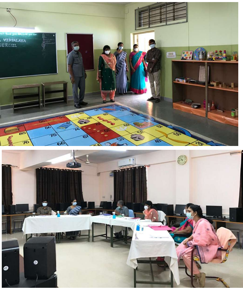
Extension Activity at Kendriya Vidyalaya