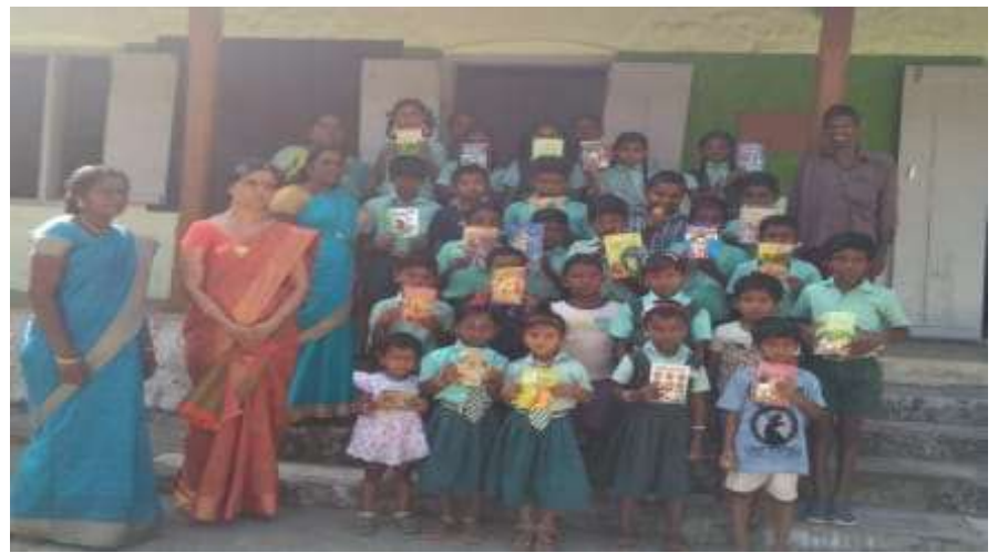
National Book week celebration in Govt Primary School Chunkankadai