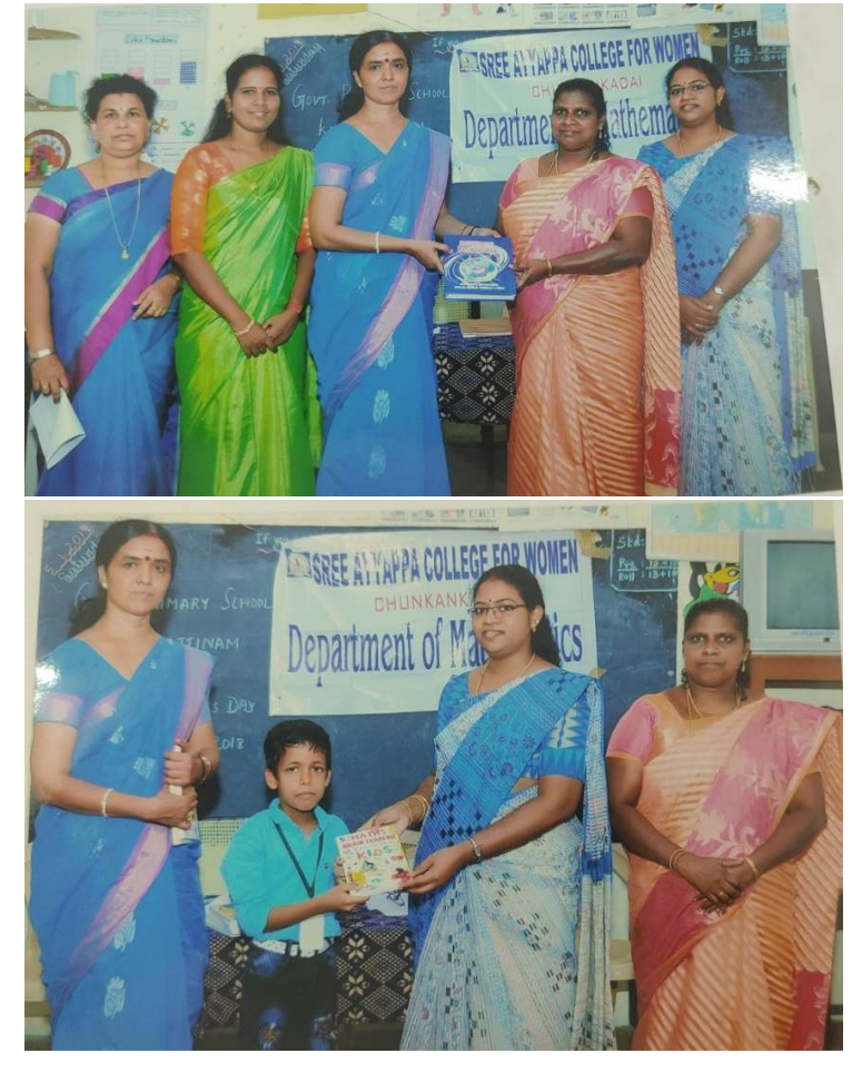
Donating Books to Govt Primary School, Kadiyapattanam