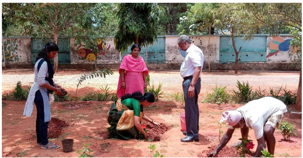
Extension Activities in Kendriya Vidyalaya, Konam