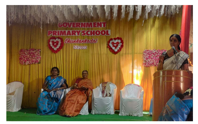
Chief Guest in School Day function in Govt Primary School, Chunkankadai