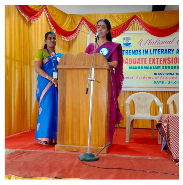
Resource Person in Post Graduate Extension Centre, MS University