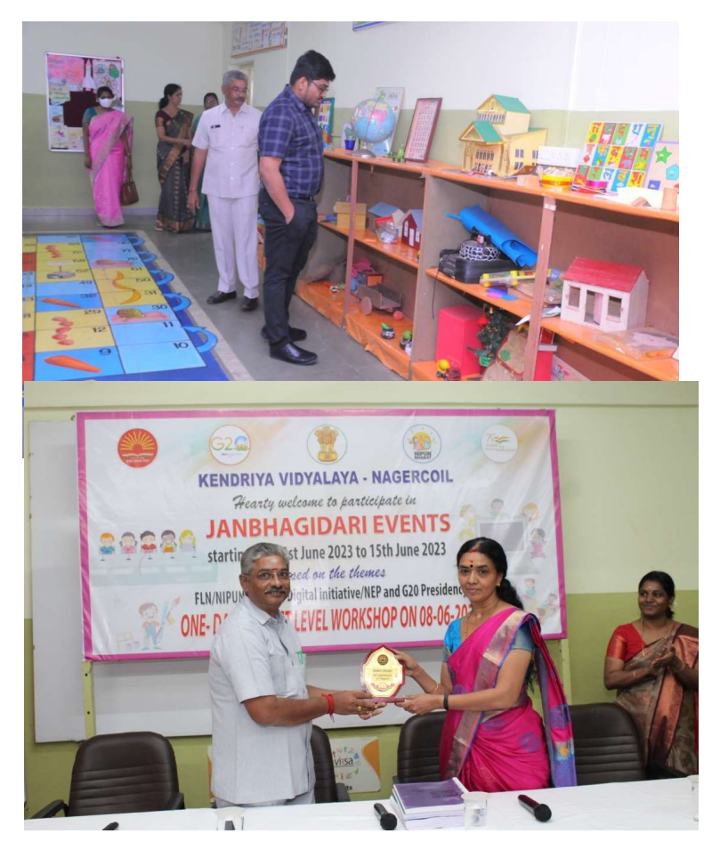
Extension Activities at Kendriya Vidyalaya