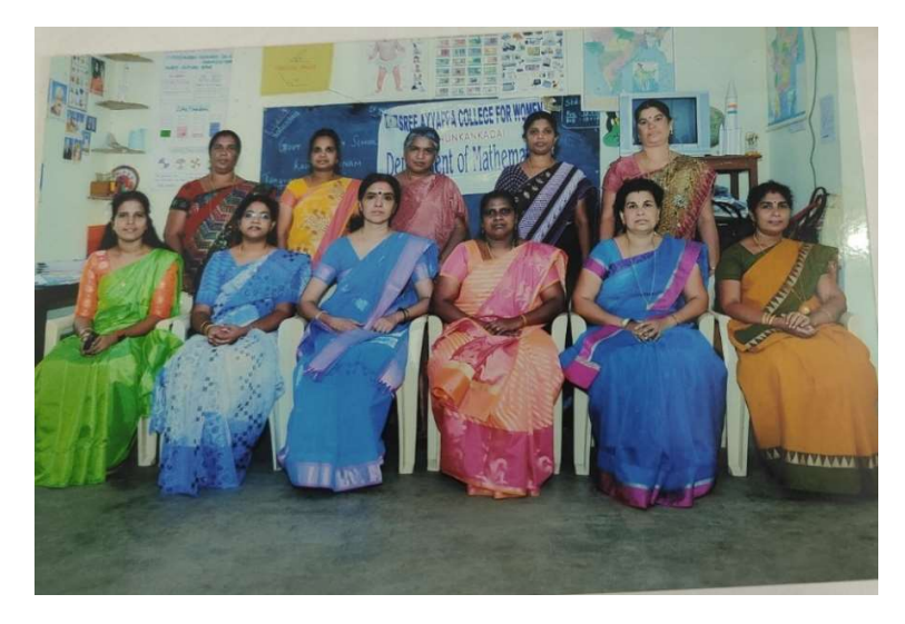
Staffs at Government Primary School, Kadiyapattanam