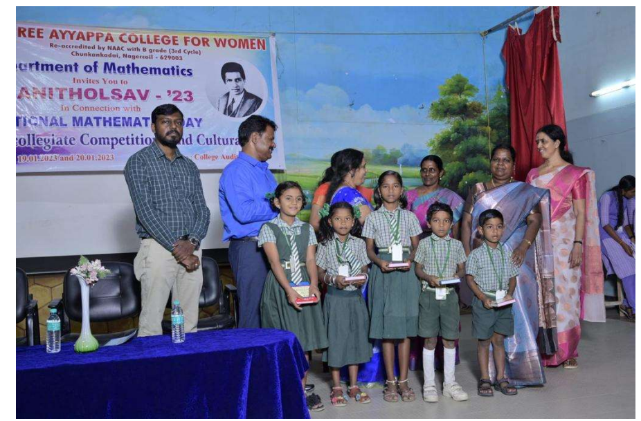
Prize distribution to students of Govt Primary School Chunkankadai at Ganitholsav-'23