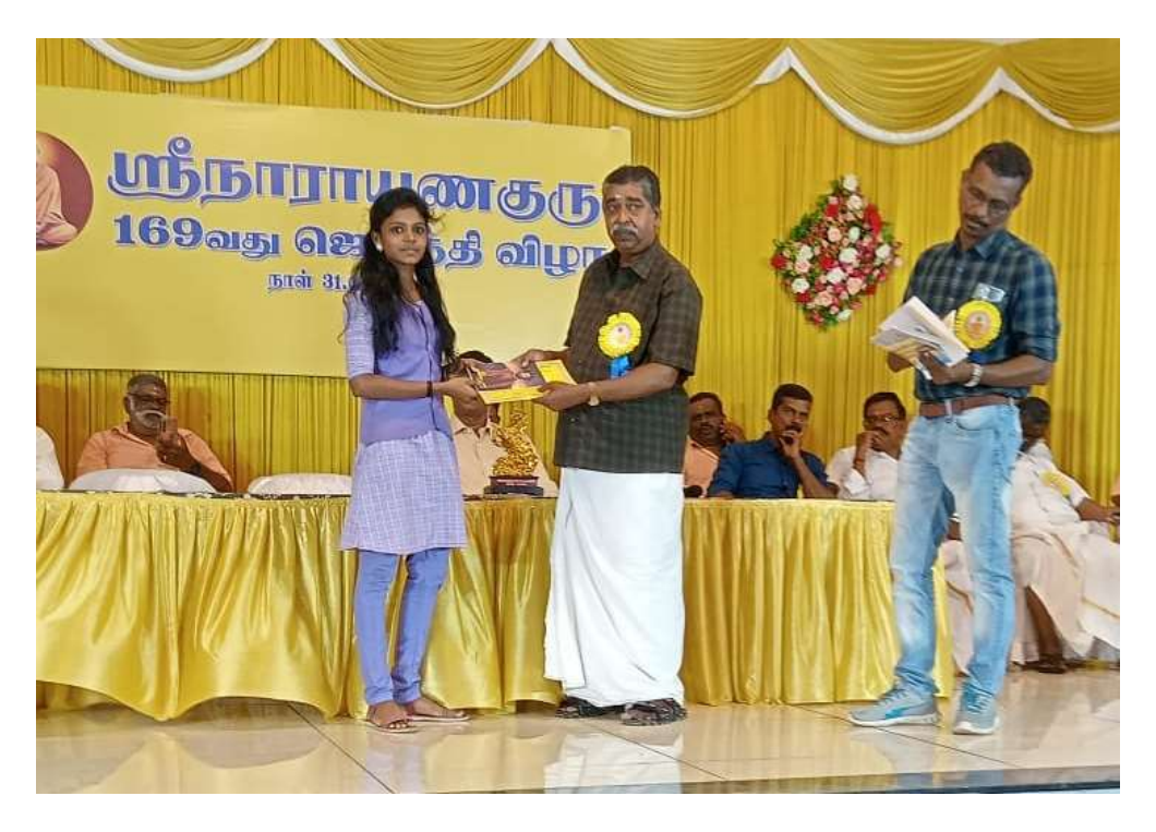
Students receiving prizes at Sree Narayana Guru Jayanti