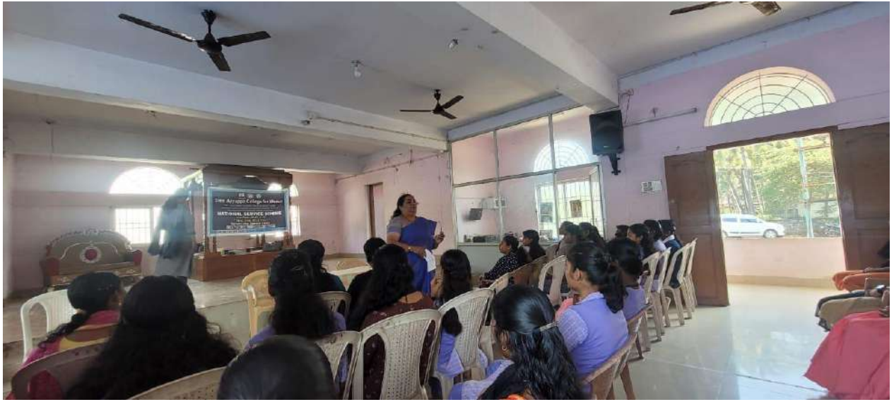
Department of English and Research Centre of Sree Ayyappa College for Women, Nagarcoil, organised a seminar on "Musings on Green Literature" on 17 November 2022.