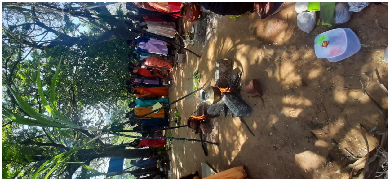
Pongal was celebrated by Zoology department on 13-1-2022 in our college campus. Students enjoyed the festival according to traditional Hindu system dedicated to Sun God.