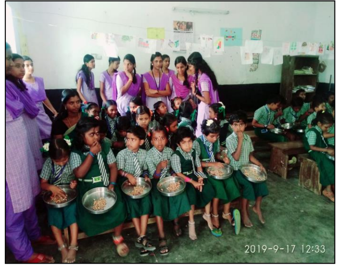
Association inauguration and Talk on Health awareness