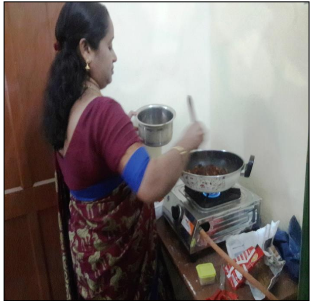
Training in pickle making