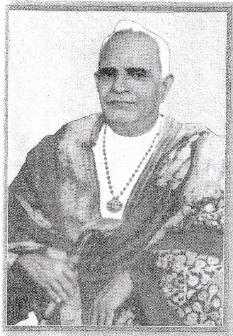
Founder Nair Service Society Padmabhooshan Sri. Mannathu Padmanabhan